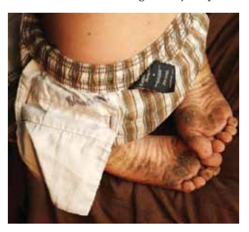
The News-Leader brings attention to the plight of children in poverty.

The value of this continued media exposure is immeasurable in dollars and goodwill. While there have been short-term fixes for some issues, the community must also develop an appropriate response and implement action. The News-Leader staff has been recognized by its parent