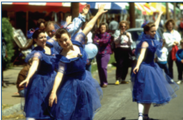
Springfield Ballet performs during Artsfest.

In Mesa, Ariz., citizens passed a “quality of life” sales tax. If an annual source of income like this were available in our community, organizations could invest their energy in providing more services to residents rather than concentrating on securing overhead expenses.