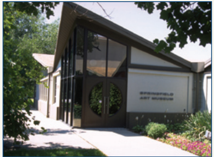
Springfield Art Museum

QUALITY AND ATTENDANCE. Responding to the needs of the growing community, arts organizations have introduced new and improved cultural experiences. Theatre venues have become more diversified, offering children’s theatre, musicals, traditional theatre, and family series as well as more contemporary productions. The Moxie, a downtown venue, offers independent movies. Art galleries are multiplying, introducing the community to national and international artists. Collaboration and improved facilities also have played a role in offering patrons a high quality experience leading to a greater interest in the arts. For example, the Springfield Ballet saw an increase of more than 1,000 audience members for its 2006 Nutcracker performances, compared to 2005.